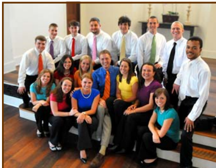
Viva Voce from Clemson University