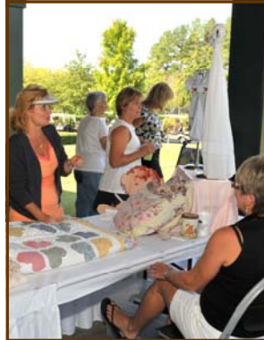
Local artist shows her crafts at the 2010 Fall Festival