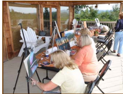
Mornings with Monet at the Hill House