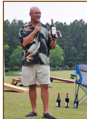
Wine Auction action at Turkey Ridge Park. All proceeds donated to the Foothills Humane Society.