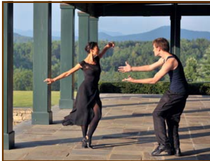
Carolina Ballet Theatre performs on the Orchard House Veranda