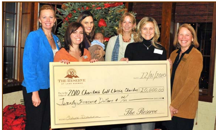
The Foundation Outreach Committee pictured with the 2010 Outreach Recipients.