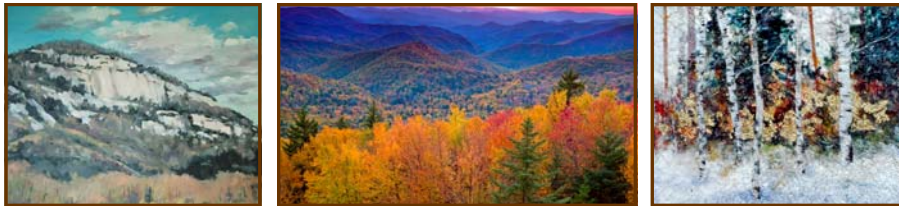
Artwork on display in the Hill House Gallery

The Hill House Art Gallery , open to the membership and general public, at The Reserve Community Foundation office featured original art from regional artists. Exhibits were rotated on a six to eight week basis and included gallery talks from each of the artists.