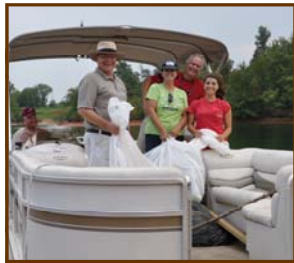
Adopt-an-Island clean-up volunteers

were a large part of the Foundation's commitment to the environment in 2010. Reserve volunteers took part in the bi-annual lake sweeps in April and September and joined the new Adopt-an-Island program with FOLKS ( Friends of Lake Keowee Society ). The Reserve is responsible for maintaining islands 17 A, B, C and D and several miles of shoreline as part of this community-wide effort to preserve one of the purest lakes in North America.