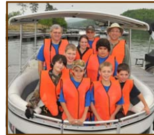
Pickens boy scouts help with the sweep