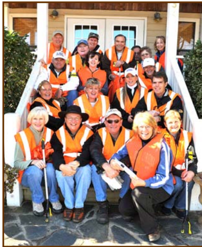
Reserve volunteers gather for the Highway Cleanup

Adopt a Highway was chosen as a project for the Community Foundation. The section of Highway 133 that runs parallel to The Reserve's property line became a quarterly clean