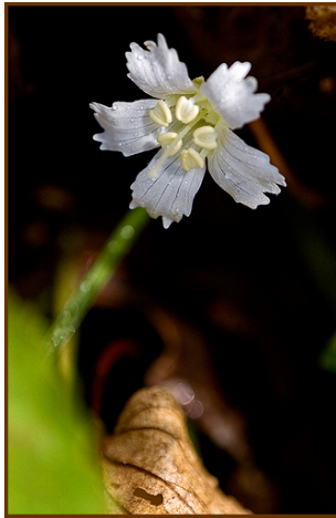
Oconee Bell wildflower

The 2010 Environmental program included the following: