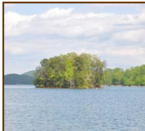
One of the four RLK adopted islands