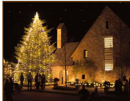
Holiday Tree Lighting