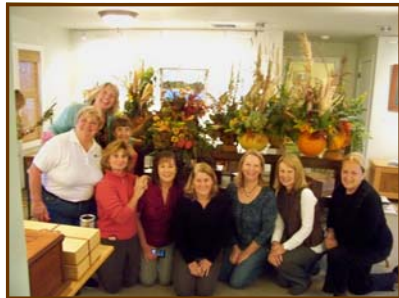
Decorating with native plants workshop

The 2010 Educational program included the following: